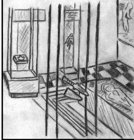
Figure 3: A sketch of the room "The Tomb," which is part of the exhibit "Tutankhamun and the Golden Age of the Pharaoh"

In many other displays of King Tut's burial pieces, the viewer saw, for example, a gold dagger with a card saying how old it was and when it was found. "Golden Age" took a more active educational route. The suspended dagger caught the visitor's attention and allowed him or her to see this intricate blade from many angles. When a visitor finished circling the case, looking up and down at the dagger, he or she could take a moment to read the literature explaining the dagger's role in the king's tomb. Instead of the traditional suit-and-tie intellectual walking through nodding his or her head in agreement of the date assigned, children on field trips might run to their classmates saying, "Did you know what they did with that?!" To accomplish this, each room of the exhibit used the most up-to-date technology in museum display, with protective casing, light-imposed text, video, holograms, lighting, and strategic placement of texts both next to the object and along the top of the case for reading accessibility.